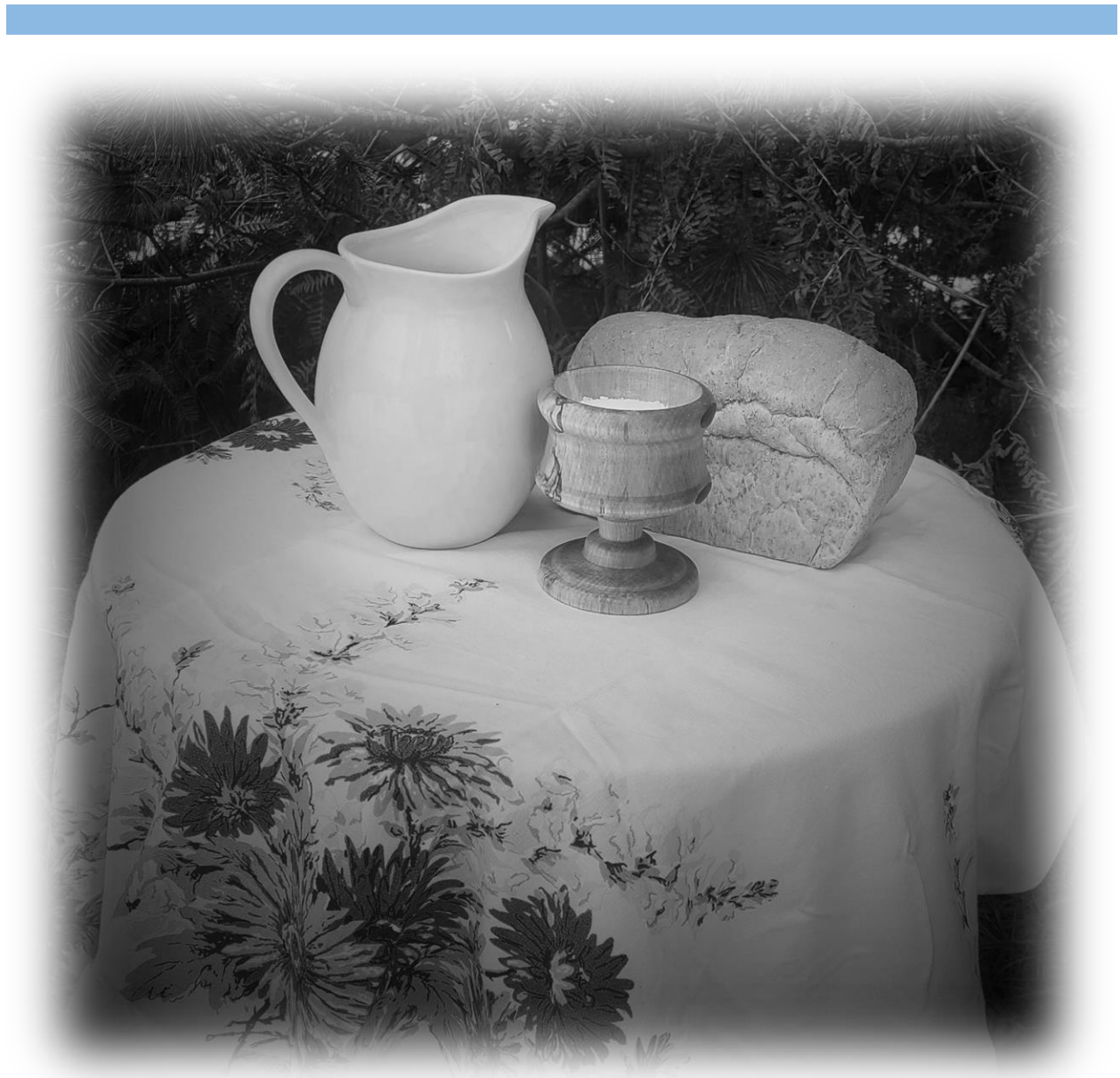
"Bread, Salt and Water" Traditionally Symbolize Peace and Hospitality